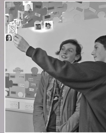
'Who belongs to our class?'