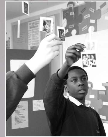
Pupils at Ralph Allen Secondary School, Bath, UK using a Group Mobile in their classroom

The Group Mobile invites teachers and students to explore their inter-connectedness, and their sense of belonging to the class group. As each person creates and attaches a personal representation of themselves that captures their sense of identity and self-expression, the mobile takes shape as a dynamic, visible representation of the entire class as a human system. It provides a focus for understanding and resolving conflicts and challenges within the group, as well as for celebrating moments of common achievement and harmony.